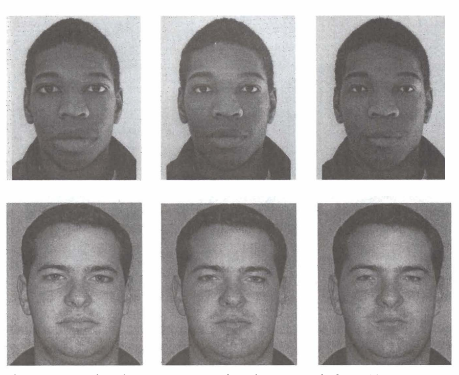
Figure 1. Examples of neotenous, normal, and mature male faces. Neotenous versions appear to the left, normal faces in the center, and mature to the right. Resumes depicted either neotenous or mature faces.

To produce resumes, a neotenized or mature version of each face was printed in color on the top of what appeared to be a one page summary of personal qualifications. Resumes were fictitious. Identical information was provided for each face except for first names; "David J. Lawrence" was paired with male portraits and "Susan J. Lawrence" with female portraits.